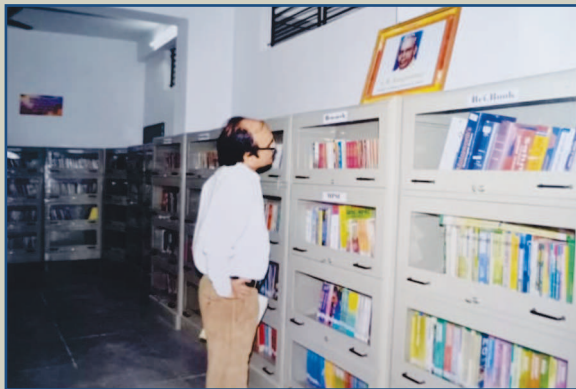
College Central Library with more than 10 Thousand books