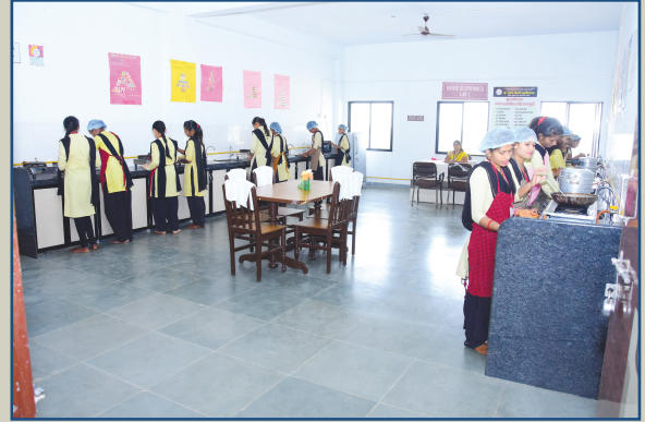
Home Economics Laboratory