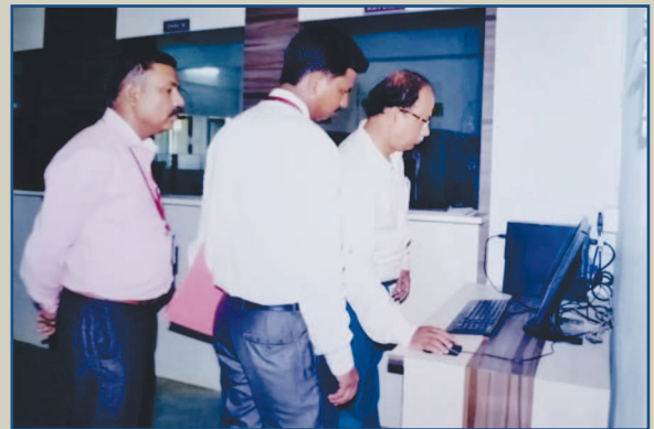
Library with full Automation